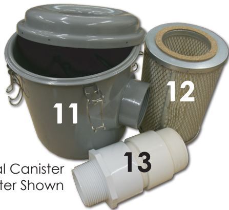
Optional Canister Filter Shown