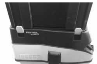
Fig. 7 - Festool latches C & D closed.